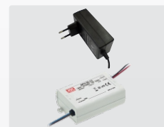
Ext. power supply 100 - 230V AC/ 14,7V (15V) DC