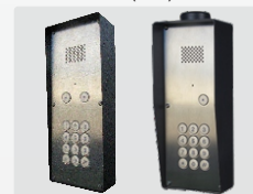
Options: 1 or 2 call buttons, complete stainless steel, with antivandal antenna on top, ...