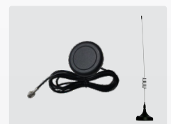
Outdoor GSM antennas (antivandal, patch, magnetic)