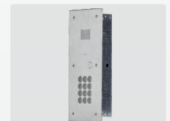
Also available for flush mounting